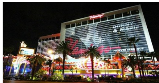
May 10-11, 2018 Flamingo Las Vegas 3555 Las Vegas Blvd, Las Vegas, NV 89109 Registration Deadline: April 23, 2018

Hotel Reservations – A limited number of respective rooms have been reserved at the following hotels. To reserve your room at the special program rate noted below, please call the hotel by the reservation deadline date and mention that you are attending the Academy of Nutrition and Dietetics Weight Management Program. You will need to guarantee your reservation with a major credit card. Payment of all room, tax and incidentals will be the responsibility of each individual.